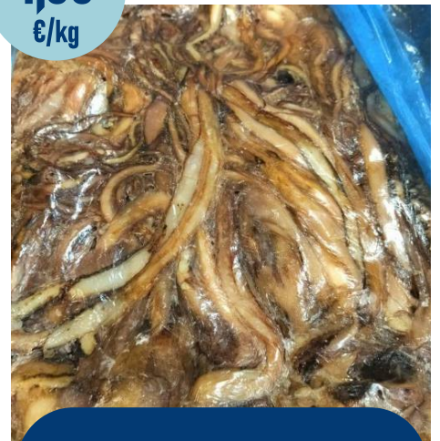
GIANT SQUID TENTACLES

50-200 g Lot: Dosidicus gigas Origin: Spain Packaging: 10 kg