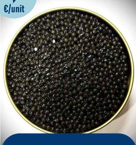
RUSSIAN STURGEON CAVIAR

Lot: Acipenser gueldenstaedtii Origin: China Packaging: 100 g