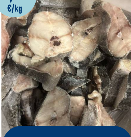
AMERICAN POLLOCK STEAKS

Skin on, with the bone Lot: Pollachius virens Origin: Lithuania Packaging: 10 kg